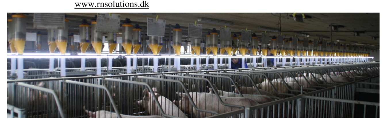
Danish Pig farm