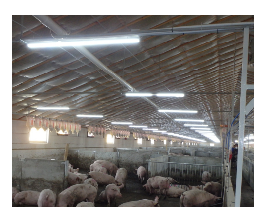
New barn, Poldanor, Poland